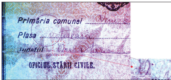
FIGURE 2: Partial view of the document in 254 nm UV, 7.65 zoom ratio. UV: Ultraviolet.