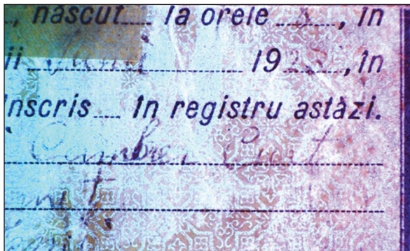
FIGURE 3: Partial view of the document in 254 nm UV, 7.65 zoom ratio. UV: Ultraviolet.