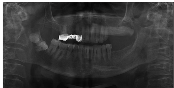
FIGURE 1: Panoramic radiograph revealed a radiopaque lesion related to an impacted third molar.

Tonsilloliths are most commonly seen in young adults who have a history of recurrent sore throat. 4,6,8 The sizes range from tiny undescrivable radiopaque lesions, to giant tonsilloliths in the literature. 6,13,14