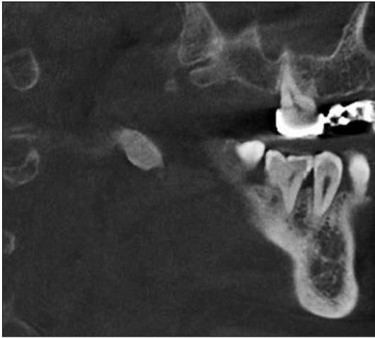
FIGURE 2: Sagittal view of computed tomography scan demonstrating a radiopaque lesion in the right pharyngeal region.