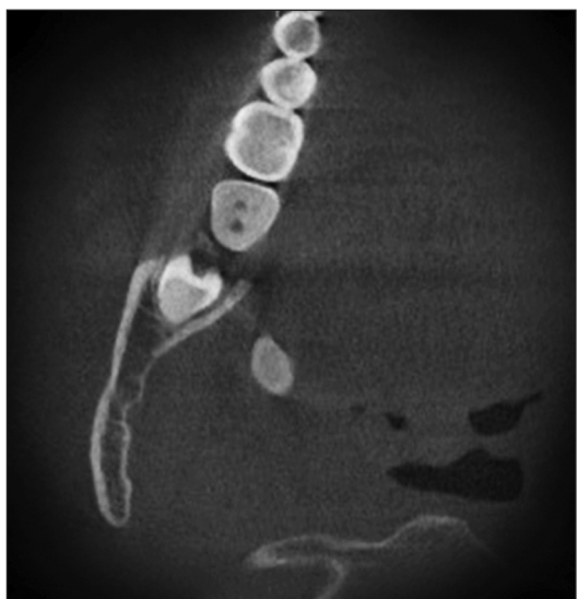
FIGURE 4: Transverse view of computed tomography scan.

Tonsils mainly consist of lymphoid tissues. 5,6 The surface of the tonsil forms crypts. 6 The specific etiology of tonsilloliths is still unknown. 1,5-7 Repeated inflammation of the tonsillar crypts may cause fibrosis of the surrounding tissues. 1,6 Retention cysts are formed within the inflamed crypts by bacterial and epithelial debris. Tonsilloliths are believed to be formed as a consequence of the calcification, resulting from the deposition of inorganic salts within the saliva as phosphate, carbonate, calcium and magnesium. 4,5,8 Foreign bodies in the tonsillar crypts such as tablet or capsules are other possible etiological factors. 5 Tonsilloliths also play a role in the inflammation of the tonsil, by acting as a reservoir for pathogen microorganisms. 10