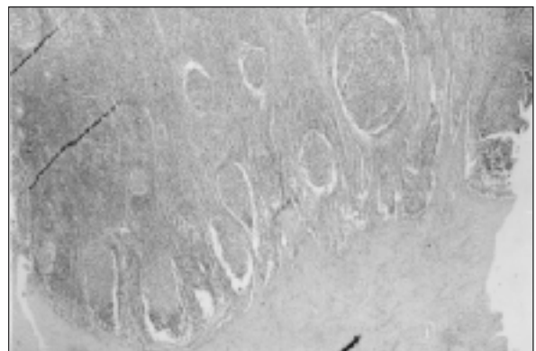
FIGURE 1: Prominent follicular hyperplasia and fibrous bundles penetrating the lymph node (HE, x40)

Corticosteroid treatment may be used in both two clinical conditions. For this patient prednisolone therapy 2 mg/kg per day was started, continued for 4 weeks and then tapered off within three months. In the follow-up, the hepatosplenomegaly,