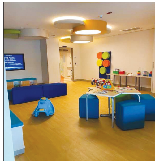
FIGURE 2: Activity room.

ratio of nurses providing service to children and families is 1.3.