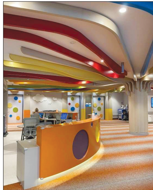
FIGURE 1: Nurse's counter and patient rooms.

The PIS has a total of 8 beds. Occupancy rate of the service varies from 30% to 50% and the mean