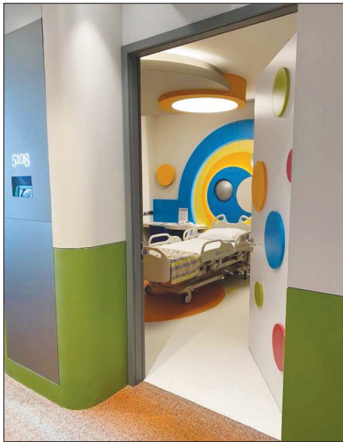
FIGURE 3: Patient room.