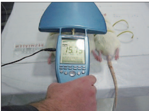
FIGURE 1: Frequency meter device.

Frequency measurements with the device were done with the rats positioned side by side. LLER doses received by the brain were calculated to be equivalent by putting rats in groups of one or four. The 10 rats were grouped side by side in groups of three and four (Figure 2). After calculating the ideal position for the device, electromagnetic LLER energy was applied for 45 minutes from a distance to be equal with energy transmitted by a mobile phone from a 0.5-1 cm distance to their head regions. After 1.5 hours and before the rats were awoken, blood were again drawn from their tail veins. This amount of time was needed for peak values of 5-HT and glutamate to be realized. A longer wait would have required the adminis-