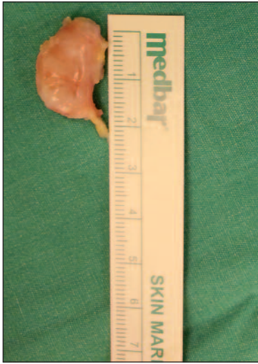
FIGURE 2: The resection of aneurysm was performed.