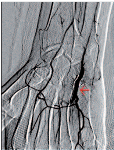
FIGURE 4: 6 week post operatively. Undisturbed arterial in-flow was seen. Red arrow points vein graft.

performed (Figure 3). Pathologic specimen was 2,1x1x1,5 cm in size and an organized thrombus in the pseudoaneurysm was diagnosed during histopathological examination. Six weeks after the reconstruction of the ulnar artery, an upper extremity arteriography was scanned in order to investigate arterial flow. Angiography proved there was no occlusion or thrombosis formation in graft anastomosis sites, and graft maintains blood through anastomosis to superficial and deep palmar arches (Figure 4).