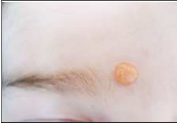
FIGURE 1: Orange-red, dome shaped papule located on the top of the glabella.