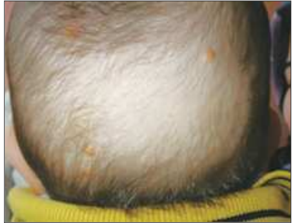
FIGURE 2: Yellow, dome-shaped nodular lesions on the scalp.