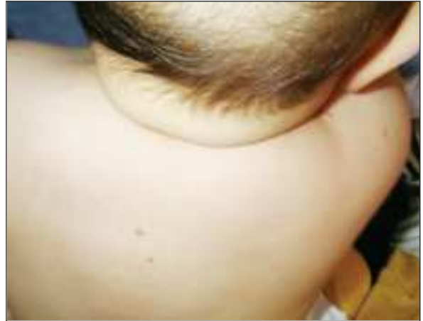
FIGURE 4: Shiny, yellowish papular lesions on the left side of upper back.

plasma cells and scattered eosinophils and prominent Touton giant cells. There was no systemic involvement.