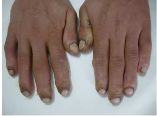
Figure 3. Periungual keratoderma and shortened nails.