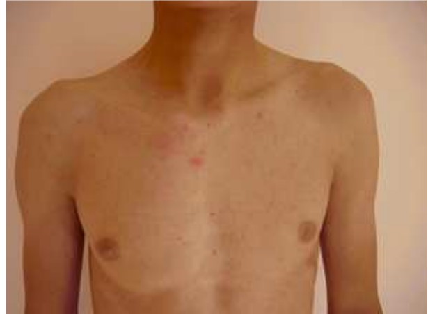
Figure 4. Prominent right hemithorax.

Clubbing-like appearance and shortened nail plate, loss of the cuticle, distal onycholysis, mild-moderate subungual debris and longitudinal striations were detected as nail dystrophy (Figure 3). The periorificial regions such as perioral, perianal and periurethral, in addition to scrotum, inguinal, popliteal and axillary areas were not involved. He had normal intelligence. Mild sensorineural and mixt type hearing loss were detected in the left and right ear (-37 dB, -40 dB respectively). There was no dental, ophthalmologic, neurological, urogenital and cardiovascular anomaly. His right hemithorax was more prominent than left hemithorax (Figure 4). It was stated that the prominent hemithorax might be resulted from the first right rib anomaly,