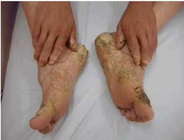
Figure 2. The keratoderma on the soles.