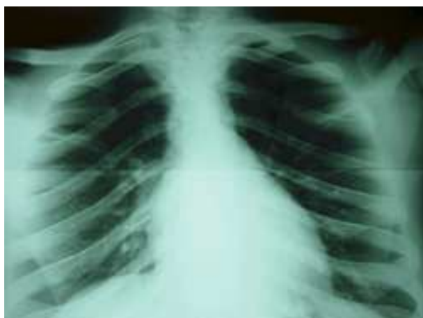
Figure 5. Radiograph showing the first right rib anomaly.

corneum. Orthokeratotic hyperkeratosis and a thick granular layer were detected in the involved epidermis. There was an increase of vascularity and a mild perivascular mononuclear inflammatory cell infiltration in the upper dermis (Figure 6).