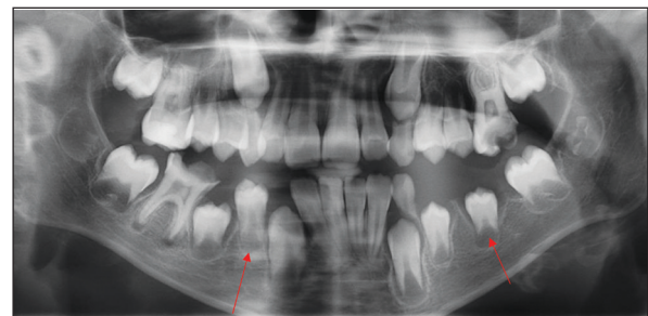
FIGURE 2: Radiographic view of a 7-year-old girl with prematurely erupted mandibular right and left 2 nd premolars (stage D) and mandibular left 1 st premolar (stage E).

The distribution of premolar agenesis and dental maturity stages is presented in Table 5. Further analysis of the developmental stages of PEPs revealed that most of these teeth were at Stage F (Figure 1), accounting for 15.3% (1,141 teeth) of the cases. Stage D (Figure 2) was observed in 85 teeth (1.1%), and Stage E (Figure 2) was seen in 385 teeth (5.1%). Notably, in 21 cases, premature eruption was accompanied by premolar agenesis.