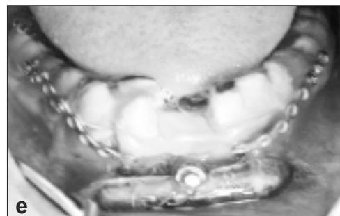
FIGURE 2: a) Preoperative clinical appearance of the patient, b) Preoperative panoramic radiography of the patient, c) Intraoperative placement of the distractor in case 2, d) Postoperative radiographic appearance of case 2 after distraction period, e) Postoperative intraoral clinical view of the distraction area.