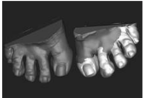
FIGURE 6: Right toe was accommodated to the opposite left defective area using 3-D digital data.

3-D digital models were acquired on a STL-file format (Figure 4).