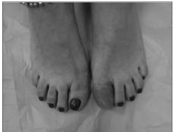
FIGURE 8: The wax pattern of toe prosthesis fitted to the patient.

An individual stone mold was fabricated using the lost wax technique. 2 The acrylic resin substructure of the nail and retained part were cleaned with acetone, and the silicone primer (Platinum Primer; Principality Medical Ltd, South Wales, UK) was applied. The substructure was placed in an oven (FN 500; Nuve AS, Ankara, Turkey) at 100 °C for 10 minutes. The clear acrylic nail with the retention side was placed on the nail area of the mold using cyanoacrylate. The base color of the skin was achieved using intrinsic pigments mixed with the silicone base (Cosmesil; Principality Medical Ltd, South Wales, UK) to match the different shades of the patient's own skin. Colored silicone was layered into the mold in the appropriate locations. The molds were closed, light pressure was applied to remove excess material, and the molds were transfer-