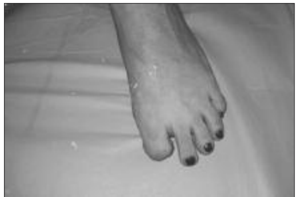
FIGURE 1: The defective foot.

Impressions were made with the patient seated and her arms held in a relaxed posture on either side of the chair. The most commonly used impression material is an irreversible hydrocolloid or dental alginate. 1 Impressions of the left and right foot were made with dental alginate (Hydrogum 5; Zhermack SpA, Badia Polesine, Italy) (Figure 2). ADA type V dental stone material (Die Keen; Heraeus Kulzer, Armonk, NY) which was