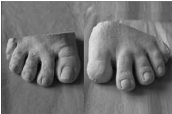
FIGURE 3: Casts of normal and defective foot.

Dental casts of the defective and normal foot were scanned with the aid of a laser scanner (Z Scanner 700; Z Corp, Burlington, MA, USA). A 3-D computer model of the cast was obtained using a 3-D laser scanning system that was developed to produce a 3-D dental cast called an "emodel". A laser scanner connected to a personal computer (Toshiba Satellite A200-230, Toshiba Europe GMBH, China) was used to acquire the 3-D spatial coordinates of the models using software purchased from Mimics (Materialise, Belgium) which loaded the 3-D data points into the scanning system's proprietary emodel software. The triangular mesh output was visualized using a stereolithography (STL) file (STL file format; 3-D Systems Inc, Valencia, Calif).