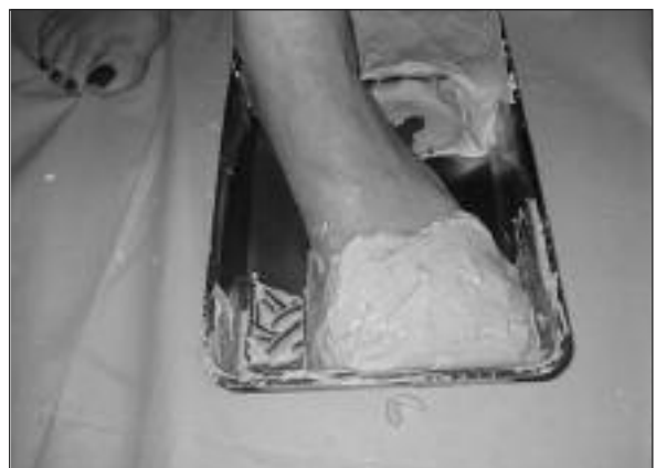
FIGURE 2: Making the impression.