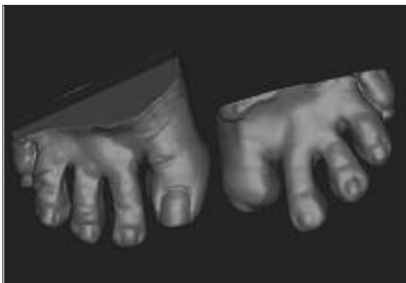
FIGURE 4: 3-D digital models of normal and defective foot.