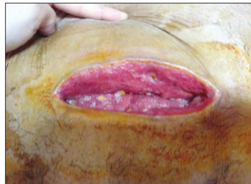
FIGURE 1: Photograph of surgical incision after sutures are removed.

Her skin biopsy showed fragmentation in ulcerated squamous epithelium and hyperkeratosis with normal dermis and focal parakeratosis (Figure 3).