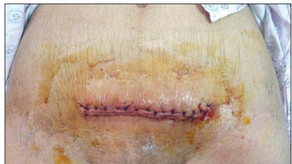
FIGURE 2: Photograph of surgical incision after second suturing. Note the dry, striated appearance on the trunk.