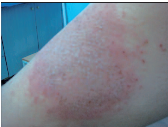
FIGURE 1: Itchy erythematous and eczematous plaques on the left upper arm. (See for colored form http://cardiovascular.turkiyeklinikleri.com/ )

Heparin-induced skin lesions are being increasingly reported, although exact incidence is unknown.