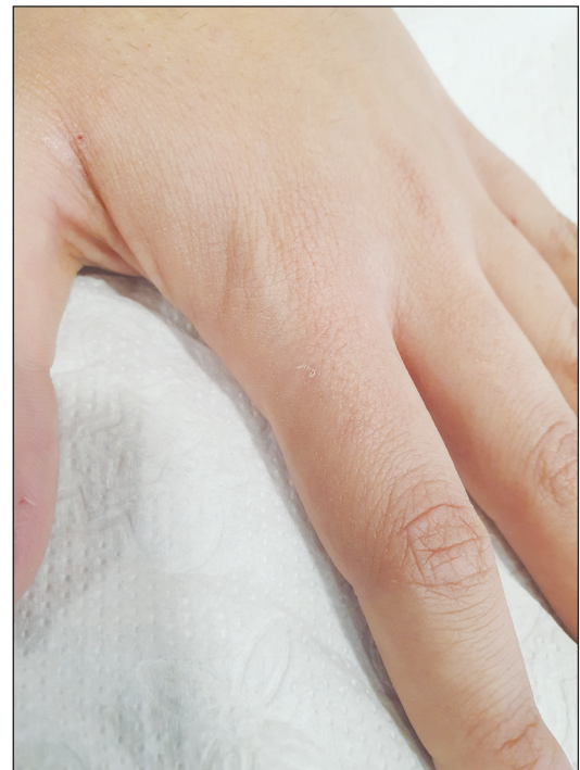
FIGURE 2: A characteristic linear keratotic lesion (burrow) on the dorsum of finger.