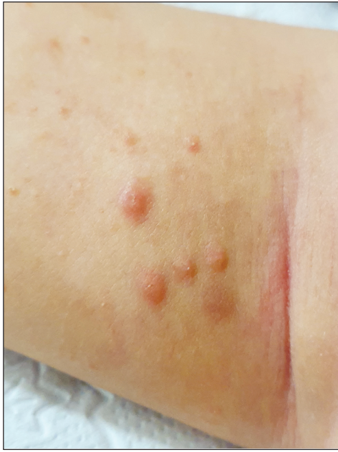
FIGURE 5: Itchy nodules on the right axilla of a two-year boy.

that not every patient is cured with a 3-day treatment are the other drawbacks. Nevertheless, it has been indicated as a cheap treatment. 7,8,12