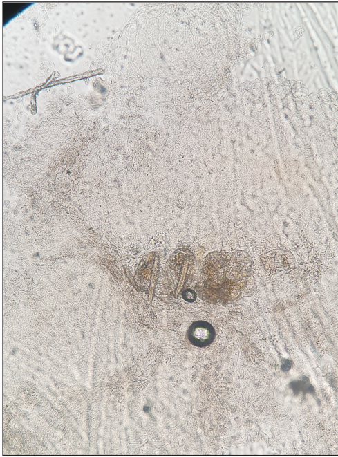
FIGURE 3: Microscopic image of eggs in skin scrapings of a burrow remnant after 3-day sulfur treatment (10% potassium hydroxide mount).

remnant of an old burrow, revealed eggs of mites ( Figure 3 ). Since there is no established method to determine whether the egg is alive or dead, we followed the patient for 2 days, and although she did not have pruritus, a second 3-day treatment was given. 4 This patient may actually have been cured with the first treatment. Some of the patients with confirmed scabies had itching during the day and stated that the severity was not different from that at night, whereas