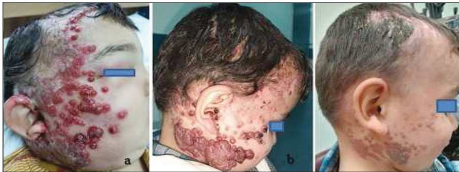
FIGURE 1: Image of Case 1 at presentation; A) Multiple red papules, plaques and vegetative masses on an erythematous and edematous surface in the area extending from the right frontal region of the scalp to the occipital region; B) The patient's appearance after ten days; C) The patient's appearance after three weeks.

vealed pseudoepithelial hyperplasia in the epidermis, edema in the dermis, edema in the keratinocytes, and cytoplasmic eosinophilic inclusions in some cells (Figure 2). There was edema in the right eye of the patient at the time of admission. In the following days, edema around the right eye increased and the left eye was closed due to edema. Systemic steroid therapy was started for this severe edema. After three days of systemic prednisolone treatment, edema regressed significantly. At the end of one week, the patient was discharged. Orf infection was considered clinically and histopathologically. By the end of three weeks, the lesions were almost completely healed (Figure 1B, Figure 1C).