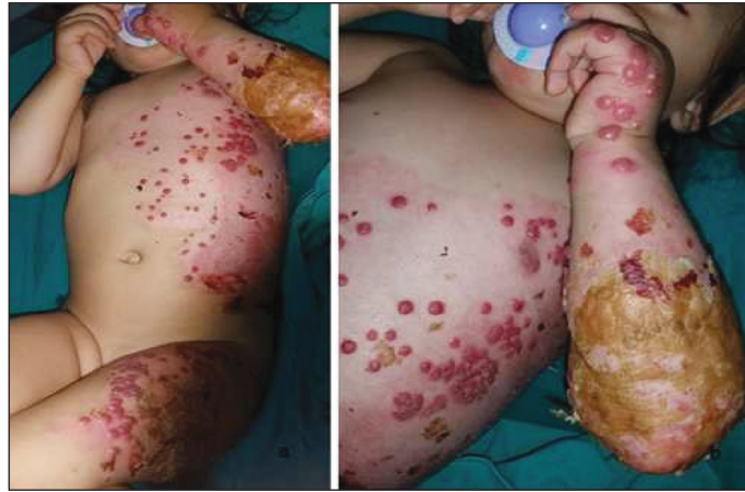
FIGURE 3: The clinical appearance of Case 2 at presentation; A) Multiple red papulonodular lesions varying between 1-2 cm on the burn scar on the trunk and extremities; B) Close view of lesions.

served, and wounds begin to epithelialize in areas of not very deep burns. Lesions begin to form in the second or third weeks. Parapoxvirus infections are usually self-limited; however, burn patients are at a unique risk for complicated orf virus infections due to the breakdown of the epidermal barrier. The recently defined concept of the “Immunocompromised cutaneous district” is vulnerable sites for the development of neoplasms, infections, and dysimmune reactions. Similar to herpetic infection, ionizing or ultraviolet radiation, chronic lymph stasis, vaccination, tattooing, neural disease, the affected skin area becomes immunocompromised cutaneous district site after burns. 7 However, lesions can also be observed in graft donor areas in burn patients. 8,9 While lesions in the graft donor area were detected in more isolated numbers, lesions were detected in the burn area equally and widely. 9 This explains the more widespread orf infection in the burn area and the suppression of local immunity in the burn area. Vascular endothelial growth factor (VEGF) plays an important role in the pathogenesis of orf by providing capillary proliferation and epidermal regeneration. By providing both viral replication and crust formation, it causes transmission through these crusts. 10 Upregulation of VEGF at the burn site may be another reason why lesions are more extensive and severe.