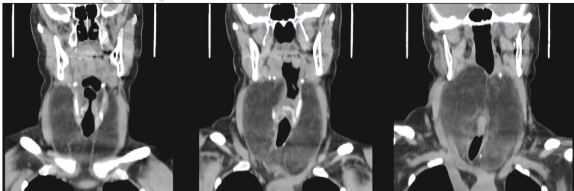
FIGURE 2: An enlarged thyroid gland with diffuse adipose tissue infiltration extending to the posterosuperior of the oropharynx and retrosternal space on coronal reformate computed tomography images.

Amyloid goiter is rare, and when the cases in the literature are examined, it has been reported that there is no gender dominance and that it is in a wide age range. 3,4 Fat infiltration of the thyroid is progressive and may present with symptoms such as dyspnea and dysphagia due to compression symptoms. Apart from the clinical complaints related to the application of our case, there was a complaint of difficulty in swallowing due to the compression of the enlarged thyroid gland. Due to the increase in size, malignant processes of the thyroid and lymphoma are included in the differential diagnosis, and therefore imaging is performed. On ultrasonographic examination, thyroid gland echogenicity is usually diffuse hyperechoic. 6 On CT examination, the link to all parenchymal fat infiltration is observed as low HU values ( -10 - -50 HU) and an increase in gland size. In MRI examination, the thyroid gland is observed to be enlarged and with the same signal intensity as adipose tissue in all