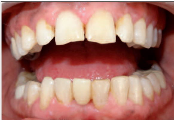
FIGURE 6: Buccal view of the cemented restoration.

cement was removed. Afterwards, light curing of the cement was completed.