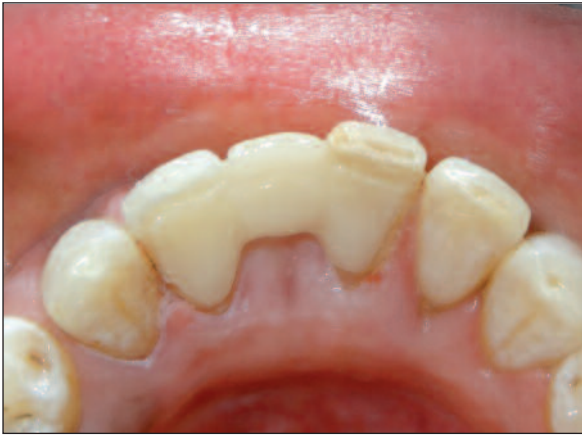
FIGURE 5: Lingual view of the cemented restoration.