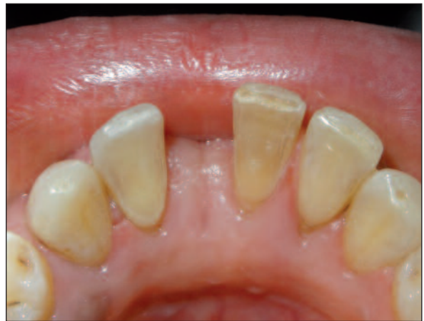
FIGURE 2: Preparation of the abutment teeth.

cal surface of pontic (Figure 3d). Spacer thickness of 100 \mu\text{m} and veneer thickness of 300 \mu\text{m} were set.