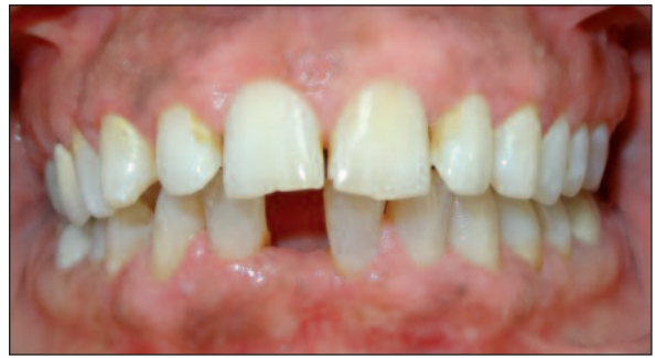
FIGURE 1: Initial view of mandibular single tooth loss.

Digital impressions of maxillary and mandibular teeth were made using an intraoral camera (Cerec Omnicam, Sirona Dental Systems, Bensheim, Germany). Then, buccal bite registration was recorded in maximum intercuspation. After 3D virtual models were obtained (Figure 3a), the model axis was set. A special software (inLab SW 4.2.1.61068, Sirona Dental Systems, Bensheim, Germany) was used to design the RBFDP. "Biogeneric Individual" and "Bridge Restoration" were selected for the design mode and restoration type, respectively. Mandibular left central incisor and right lateral incisor were selected as "veneers" and mandibular right central incisor was selected as "pontic". Margins were drawn on the virtual model (Figure 3b). After a restoration proposal was calculated by the software, some modifications were made on this design. To generate a cleanable space for tissue surface of the pontic, "lingual opening angle" parameter of the restoration was set 15° (Figure 3c). Soft tissue contact was ensured at the buc-