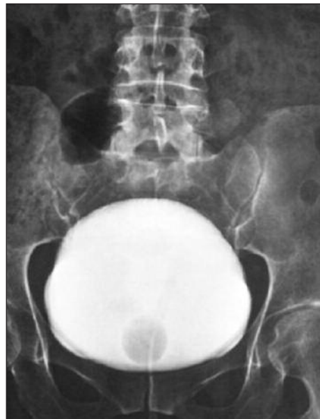
FIGURE 2: Cystography after transurethral resection and fulguration showing no extravasation.

(See color figure at http://www.turkiyeklinikleri.com/journal/uroloji-dergisi/1309-632X/ )