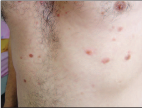
FIGURE 1: The bullae at the interscapular area of patient.

matologic examination revealed erosions and bullae on his presternal area, interscapular area and upper extremities (Figure 1). The erythrocyte sedimentation rate, whole blood count, fasting blood sugar level, liver and kidney function tests, thyroid function tests, hepatitis markers, anti-human immunodeficiency antibodies, rheumatoid factor, anti-nuclear antibodies were within normal limits. Antithyroid peroxidase antibody (anti-TPO Ab) level was 119.4 IU/mL (normal, 0-34 IU/mL), antithyroglobulin (anti-Tg) antibody level was 1067 IU/mL (normal, 0-115 IU/mL). The ultrasonographic examination of thyroid showed an enlarged gland with a homogeneous parenchyma. The case was appraised as Hashimoto's thyroiditis with euthyroidism.