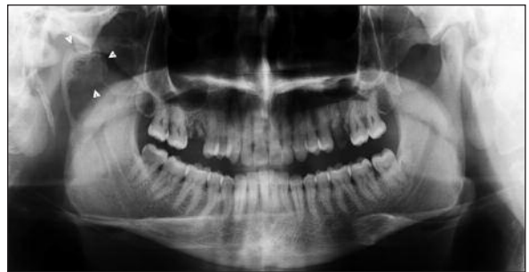
FIGURE 2: Panoramic radiograph revealed border of the enlarged condylar head (arrow heads).

http://www.turkiyeklinikleri.com/journal/dis-hekimligi-bilimleri-dergisi/1300-7734/ )