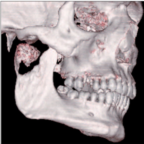
FIGURE 3: Three-dimensional reconstruction image revealed TMJ metastasis affected the condyle and ramus of the right mandible.