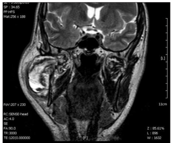
FIGURE 5: MRI (T2 weighted image, coronal view) revealed the malign tumor infiltrating the masseter, lateral pterygoid muscle and causing destruction in the mandible.

The mandibular molar region is the most frequently affected location in the maxillofacial area in terms of metastatic tumors. 9 However, of all the