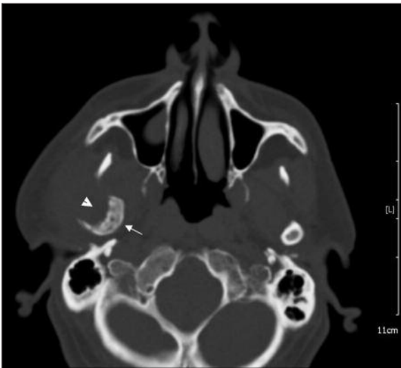
FIGURE 4: Axial CT scan (in bone window) revealed crescent shaped condyle with bone production (arrow) and destruction (arrow head).

http://www.turkiyeklinikleri.com/journal/dis-hekimligi-bilimleri-dergisi/1300-7734/ )