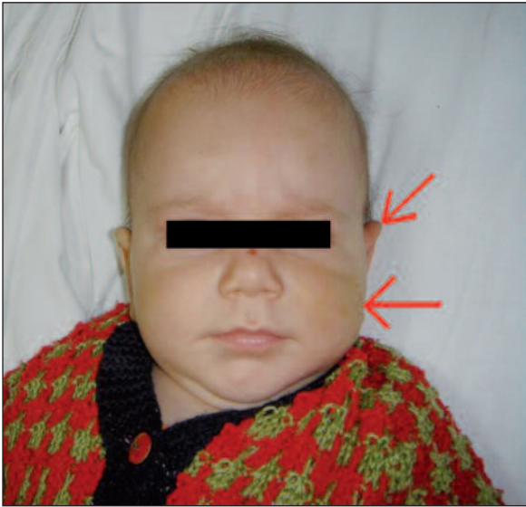
FIGURE 2: In the Case 2, there were multiple ecchymoses on the right zygomatic bone and the left ear.

(See for colored form http://tipbilimleri.turkiyeklinikleri.com/ )