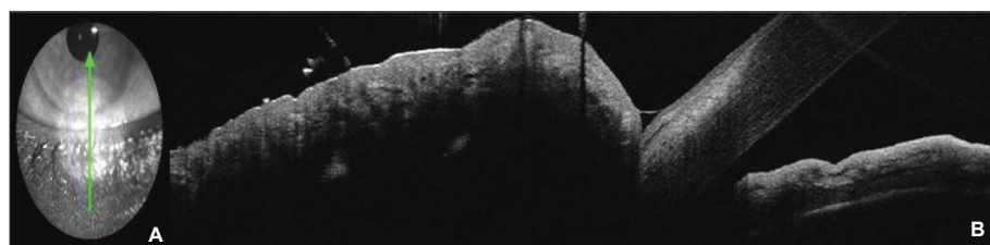
FIGURE 2: Illustration of the measurements of the tear meniscus level height by anterior segment optical coherence tomography.