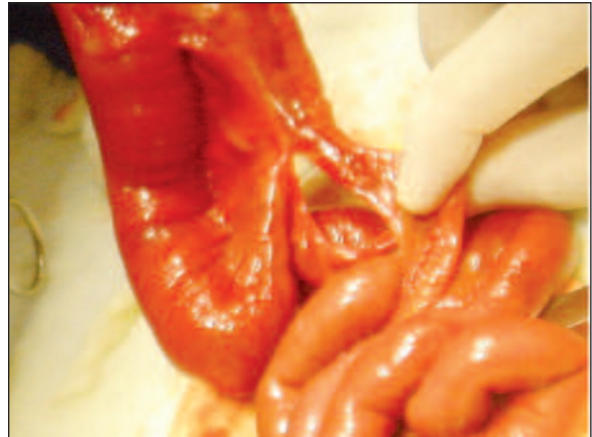
FIGURE 2: The jejunum segment which was located distally to the ligament of Treitz had undergone atresia and intestinal volvulus existed beyond the atretic intestinal segment.

undergone atresia and intestinal volvulus existed beyond the atretic intestinal segment (Figure 2). After the involved intestinal segments were excised, ileostomy was opened and total parenteral nutrition was commenced.