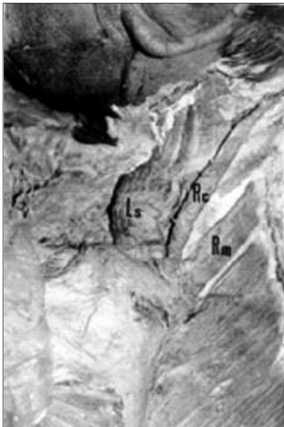
FIGURE 2: Insertion of the occipito-scapular muscle and its relation with the adjacent structures are shown. Ls: Levator scapula muscle, Rc: Occipito-scapular muscle, Rm: Rhomboideus minor muscle.

upper extremity that are not regularly present in the human. 8