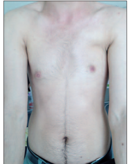
FIGURE 1: Left sided hypoplasia of pectoralis major muscle.

The typical components of Poland's syndrome include unilateral hypoplasia or absence of the sternocostal portion of pectoralis major muscle and hand defects (as syndactyly) affecting the same side of the body. 3,4 Co-