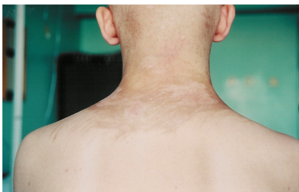
Figure 1. Linear flagellate hyperpigmentation on the neck.