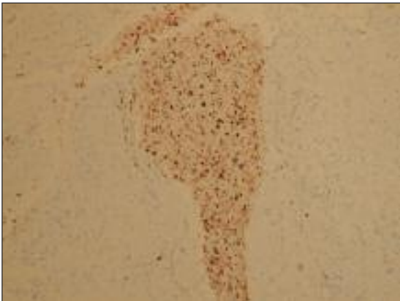
FIGURE 3: Immunohistochemical examination showed cytokeratin-7 positive staining consistent with high grade urothelial carcinoma metastatis (Cytokeratin-7, x 100).

and kidney in 34, 30, 13, 8 percent of the cases respectively. 9 In a recent study which reported clinicopathologic and outcome features of 17 patients with metastatic tumor to the penis primary sites and histological types are as follows: 6 urothelial carcinomas of urinary bladder, 4 prostatic carcinomas (2 adenocarcinomas and 2 adenosquamous carcinomas), 2 colorectal adenocarcinomas, 2 pulmonary carcinomas (1 squamous cell carcinoma and 1 small cell carcinoma), 1 squamous cell carcinoma of base of the tongue, 1 cutaneous malignant melanoma, and 1 acute myeloid leukemia. Most of