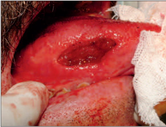
FIGURE 2: Appearance of the hemangioma immediately post-surgery.