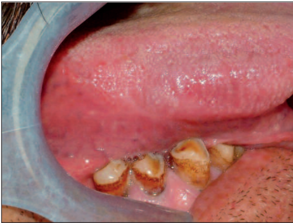
FIGURE 3: Intra-oral appearance of the patient 6 months after the surgery.

are regarded as significant factors involved in the proliferation of embryonic vascular tissue; however, a congenital theory has been also been put forward based on the high incidence of hemangiomas during the first years of life. 9 In the case presented here, the hemangioma is likely to have developed as a result of repeated mechanical trauma caused by abraded teeth during continuous movement of the tongue toward an edentulous area in the mouth as part of functional movement, thus corroborating the role of trauma in the etiology of these lesions.