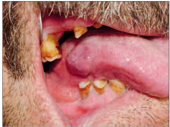
FIGURE 1: Pre-operative appearance of the hemangioma.

A pre-diagnosis of lingual hemangioma was made. Due to the large size of the lesion, a high-