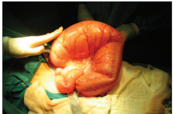
FIGURE 2: Sigmoid colon volvulus.

Large intestinal volvulus can develop idiopathically or due to several factors. These factors include chronic constipation, Hirschsprung's disease, excessive fiber in the diet, decreased intestinal motility in mentally retarded patients due to the psychotropic drugs used, malrotation, past surgery and adhesions, Chagas disease, myotonic dystrophy and Prune Belly syndrome. 3-9 There are also some cases reported after an antegrade colonic enema. 10 Constipation may be due to intermittent volvulus, or a mechanic volvulus may develop following chronic constipation as in Hirschsprung's disease. The presence of an abnormal posture as in patients with cerebral palsy can also be a predisposing factor in the development of volvulus by causing colonic distension. Cecal, transverse or sigmoid