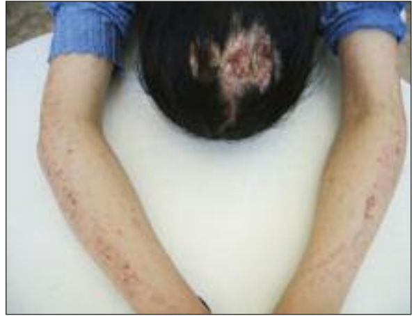
FIGURE 3: Aplasia cutis accompanying the linear lesions of Goltz syndrome is seen.

No pathology was found in routine laboratory tests, X-ray graphy of the lung, abdominopelvic ultrasonography and cranial magnetic resonance examinations. Bone X-rays revealed decrease in lumbar lordosis, thoracal antero-spondylolisthesis