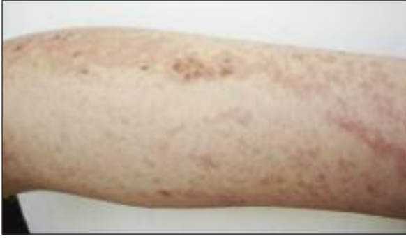
FIGURE 1: The appearance of hyperpigmented, erythematous, atrophic lesions in a linear configuration localized on upper extremity.