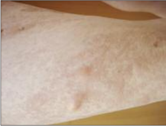
FIGURE 2: The yellowish nodule (fat herniation) on arm is seen.

erythematous and atrophic patches in a linear and swirl configuration following Blaschko's lines were detected (Figure 1,2). Moreover, soft, yellow nodules (localized herniations of subcutaneous fat) were detected on the bilateral upper and lower extremities and on the trunk. Telangiectases were more prominent on her face. The patient had an asymmetrical face. Examination of the hands nails revealed grooving. In addition to these findings, alopecia with an atrophic base on the vertex of the scalp was detected. (Figure 3). Our patient was not a product of consanguineous marriage and none of her family members had a similar disease. The histopathological examination of the skin biopsy revealed hypoplasia of dermis, a few adnexial structures and adipose tissue in upper dermis, which were consistent with the features of Goltz syndrome (Figure 4). The biopsy taken from the scalp showed fibrosis in entirely dermis. No adnexial structures were detected. (Figure 5). These histo-