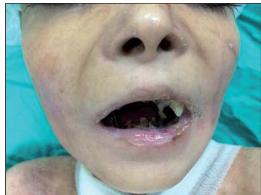
FIGURE 3: Mouth opening.