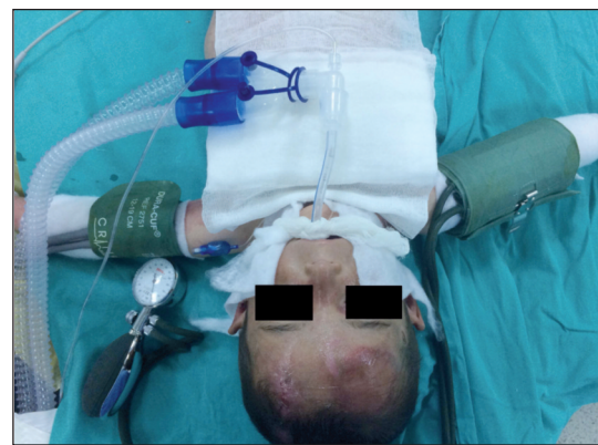
FIGURE 4: The blood pressure apparatus encircling the patient's arm.

mg paracetamol and 10 mg tramadol were used for postoperative analgesia. The patient was treated with 1 mg/ kg sugammadex and no complications occurred in the surgical operation and anesthesia management that lasted 100 minutes. He was evaluated by pulse monitorization in the recovery room. The Aldrete scoring system was used for de-