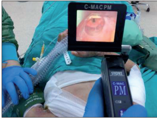
FIGURE 5: Endotracheal intubation with Videolaryngoscope.

termining when patient can be discharged from recovery room. The patient's Aldrete score was determined to be 12 at the 15 th minute. And the patient was transferred to the clinic.