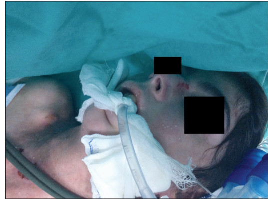
FIGURE 2: Endotracheal tube binding.

Fourteen year old male patient, 25 kg was referred to surgery for pseudosyndactyly on the hand by the plastic and reconstruction surgery clinic. During the physical examination of the patient, who had growth and development retardation, pullae lesions were discovered in different phases on the body, and pseudosyndactyly was seen on his hands. Mallampati could not be evaluated as his mouth opening was constricted (Figure 3). The patient, who was not premedicated was put on the table without help. Cotton was wrapped around the blood pressure apparatus encircling the patient's arm, ECG electrodes were not attached (Figure 4). The face mask was lubricated with vaseline and placed on the patient's face without pressure. Midazolam 1 mg, propofol 2 mg/ kg , rocuronium 0.6 mg/ kg, and fentanyl 25 mcg were administered, and endotracheal intubation was performed with a 5,0 cuffed endotracheal tube by using a video laryngoscope due to the probability of difficult intubation (Figure 5) Eye protection was provided with antibiotic pomade. The patient's anesthesia was administered with 50% O 2 / air, 2% sevoflurane. 300