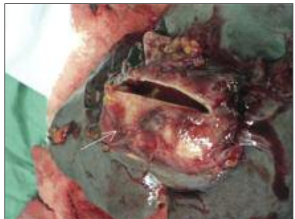
FIGURE 4: After the spleen was resected with the cyst, the thick-walled structure of the cyst (arrow).