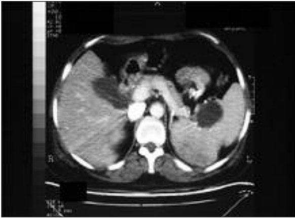
FIGURE 1: The cystic lesion (arrow) located in splenic hilus observed in abdominal tomography.