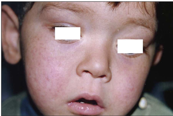
FIGURE 1: Poikilodermatous changes of the cheeks at two years old.

pulation which is resulted in premature respiratory failure. 11 It is characterized chiefly by obstruction and infection of airway and by maldigestion and its consequences. CF is the major cause of severe chronic lung disease in children and is responsible for most exocrine pancreatic insufficiency during early life. The other features of CF are failure to thrive, abnormal stools, intestinal obstruction, electrolyte and acid-base abnormality, vitamin deficiency states, acrodermatitis-like rash, edema and the existence of family history. 12 The association of CF with albinism 13 and eczema 14 has also been reported. Airway abnormalities may be found in patients with RTS. 1 To the best of our knowledge, the association of CF and RTS has been initially described by Lewis in 1972 15 Herein, we report a four-year-old boy with RTS and CF.