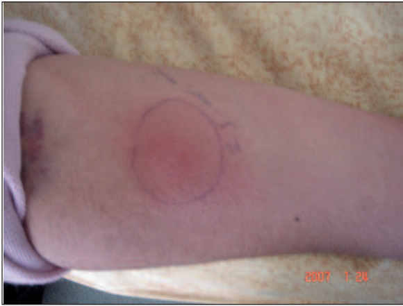
FIGURE 2: A strong positive Mantoux test with intradermal injection of 0.1 mL purified protein derivative after 72 hours.

(See for colored form http://tipbilimleri.turkiyeklinikleri.com/ )