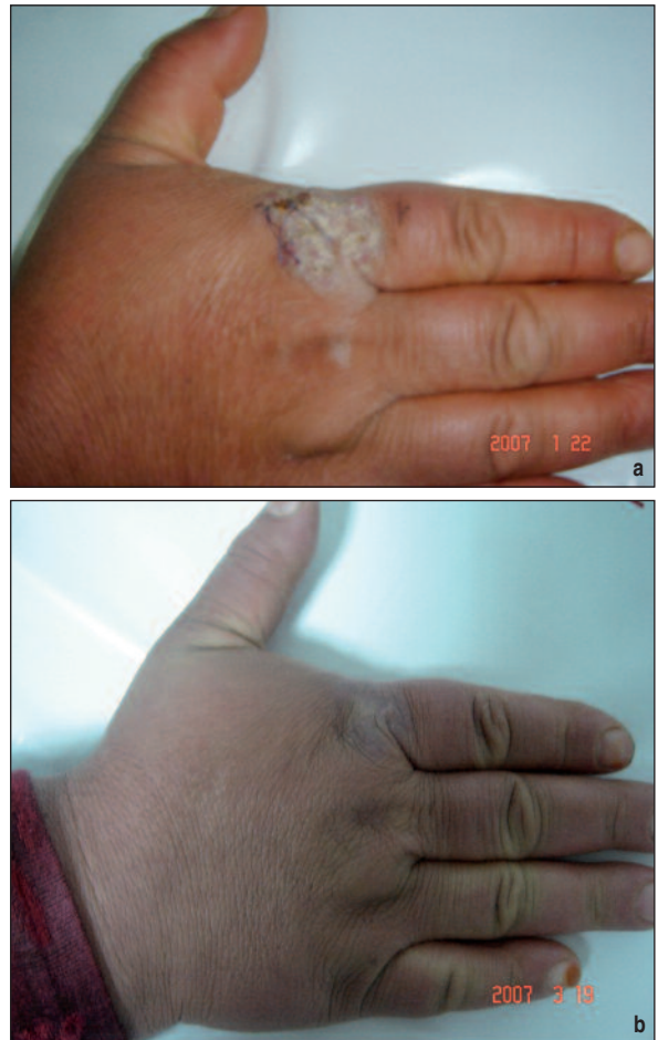
FIGURE 1: a. Before treatment: A well circumscribed plaque with irregular surface on dorsum of the right hand.

We performed a skin biopsy of the lesion. TVC, chromoblastomycosis and verruca vulgaris were considered in the differential diagnosis.