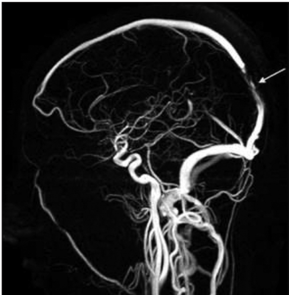
FIGURE 2: Posterolateral view of 3D reformatted MR venography image shows inconsistency of contrast intensity in posterior part of superior sagittal vein.

revealed the possibility of dural venous thrombosis (Figure 2).