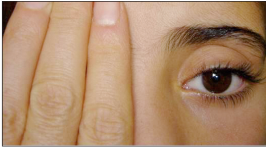
FIGURE 2: It is seen that when the ptotic eyelid was covered, contralateral retracted eyelid improved.

accordance with the recommendations of pediatric neurology department. Six months and two years after the treatment, gradual improvement was observed in the right eyelid ptosis and in the left eyelid retraction (Figure 3 A, B). The symptoms of patient resolved completely at the end of the fourth year of the treatment (Figure 3 C). Results of two-times repeated TSH, T3, T4, TSR receptor antibody tests, thyroid USG and AchR antibody test, were reported to be normal.