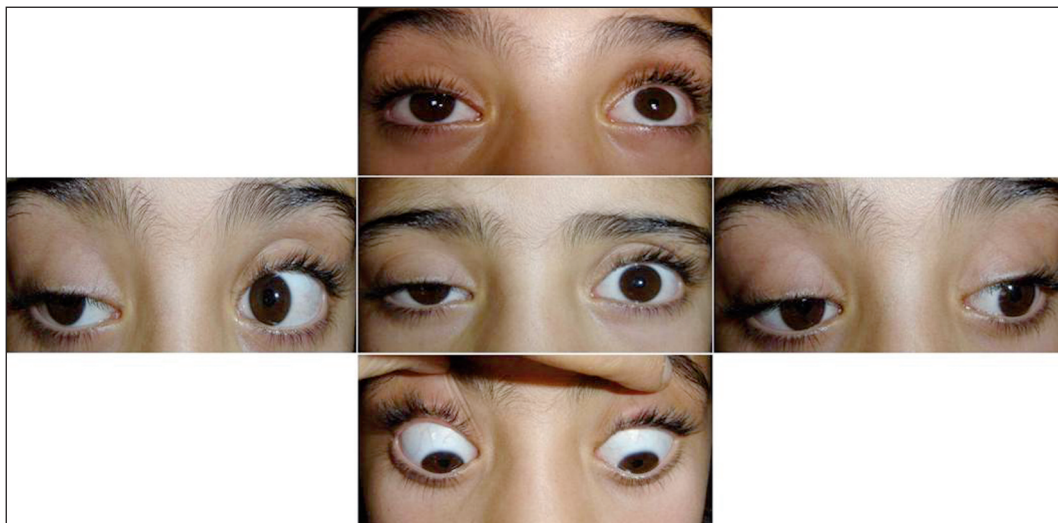
FIGURE 1: Images of the patient at initial examination.

Since, her parents noticed the alteration of her eyelid position throughout the day, we performed single fiber electromyography (EMG), and it was reported as compatible with MG. AchR antibody level was 0.20 nmol/mL (normal range is 0.00-0.50 nmol/mL) and the findings of chest and orbital computerized tomography (CT) were normal. Depending on clinical and laboratory findings, 7 mg/kg pyridostigmine bromide which is an acetylcholinesterase (AChE) inhibitor, was administered in