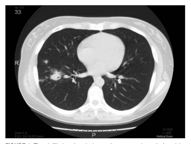
FIGURE 1: The air-filled cavitary lesion, and accompanying reticulonodular infiltration, tree-in bud appearance on right lower lobe on the thorax CT.

19 year-old female patient was referred to Department of Thoracic Surgery with cough, sputum and hemoptysis (approximately 20 cc/day) complaints for three months. On her background, she was non-smoker and she had seasonal allergic dermatitis. She had no contact history with active tuberculosis patient recently. On physical examination, there was no any pathologic finding. Performing her chest radiograph and thorax computed tomography (CT) angiography was revealed right hilar lymphadenopathy, mediastinal multiple lymphadenopathies which diameter under the 1 cm, a air-filled cavitary lesion with 2.8 cm diameter and accompanying reticulonodular infiltration. bronchiectasis, tree-in bud appearance, bronchial thickening on right lower lobe, and few milimetric nodular lesions on the bilateral lower lobes (Figure 1). The following differential diagnoses were considered in patient: pulmonary tuberculosis, fungal infection, aspergilloma, pulmonary hydatid disease and wegener granulomatosis. On laboratory analysis, biochemical and hematologic laboratory tests were normal. Peripheral eosinophilia was not found. Immunologic markers for wegener granulomatosis and the other vasculitis and galactomannan were negative for fungal infection. Ziehlnielsen stain of sputum for acid-fast bacilli (AFB) was found as negative for sixth times. Her tuberculin skin test (TST) was 20 mm with BCG positiv-