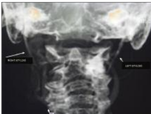
FIGURE 2: MIP image at the AP projection of the styloid process in bone protocol. Although length of the both styloid processes were same, because of the deviation of elongated styloid process to medial, left elongated styloid process was close proximity to the left internal carotid artery.