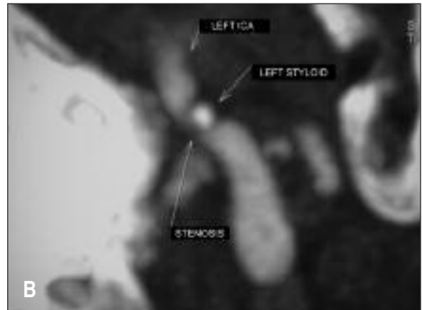
FIGURE 1: Image of the MSCT- left internal carotid artery compressed by left elongated styloid process. (A) thin VRT image at the AP projection; (B) thin MIP image at the transverse oblique projection.