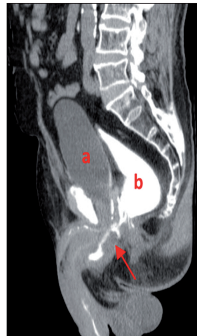
FIGURE 2: Computed tomography: a) bladder, b) rectum.

Written informed consent has been obtained from the patient for publishing this case.