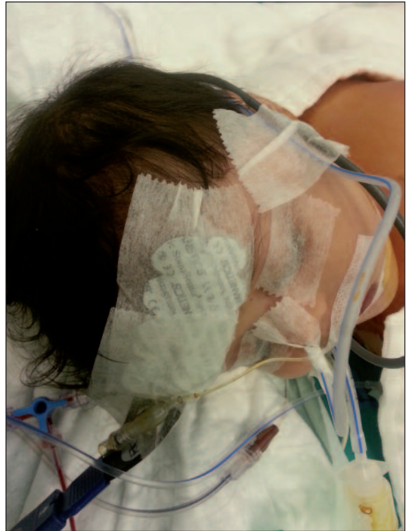
FIGURE 2: NIRS probe on the forehead of the patient.

http://www.turkiyeklinikleri.com/journal/journal-of-medical-research-case-reports/1300-0284/ )