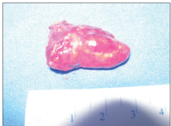
FIGURE 2: The parathyroid adenoma after the left video assisted thoracoscopic surgery (VATS).

It is estimated that 11%-25% of all ectopic parathyroid glands are present in the mediastinum and 2% of these are not accessible through a cervical incision. 12 These cases require sternotomy or thoracotomy, which has a morbidity rate that approaches 20%. 13 In the anterior mediastinal compartment, VATS has been widely applied as a less invasive procedure. It is feasible and less invasive; the incision is small therefore the postoperative pain is less. Parasternal mediastinotomy (Chamberlain procedure) may be an alternative approach