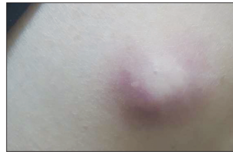
FIGURE 2: Glandular tularemia, before fistulisation.