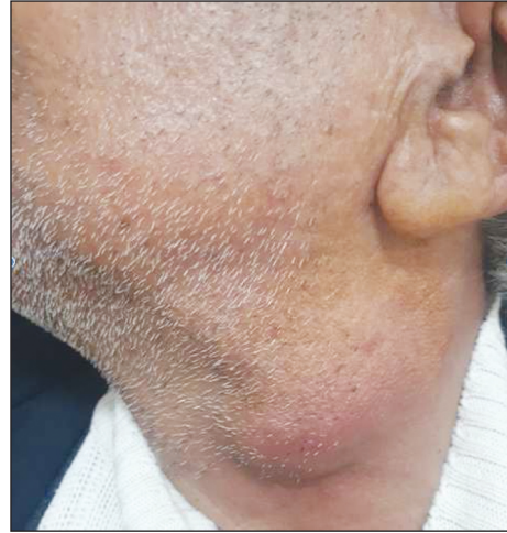
FIGURE 1: Glandular tularemia.

17.14%) before diagnosis. Relapse was seen in only two patients, two of them had glandular tularemia, and both had negative serological test initially. Reinfection was not seen in any case. The mean recovery time was 60 days. The common suspicious contact was the use of drinking water from street fountains.