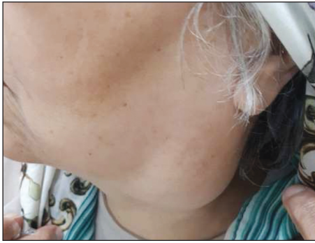
FIGURE 4: Glandular tularemia.