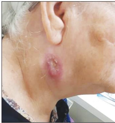
FIGURE 5: Ulceroglandular tularemia.

In fact, the water in these fountains originated from the spring waters from the Mount Ida. There were about 80 fountains in this area. Chlorination of spring water was also applied before transfer to the fountains. Chlorine level was measured monthly. Although chlorine content was sufficient (0.5 PPM), F. tularensis PCR was positive in 35 of these fountains (35/80, 43.75%). It was shown that this was actually a water-borne outbreak. Samples from the reservoirs also showed positivity for F. tularensis . The reservoirs of spring waters were discharged and the remaining sediment was removed. High dose chlorination was performed after cleaning (1 PPM). Control samples of tanks and fountains were taken after two weeks and all of them were found to be negative for F. tularensis DNA by PCR.