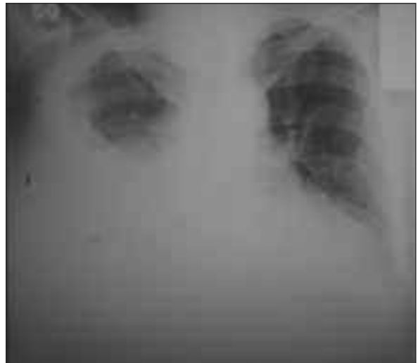
FIGURE 1: Chest x-ray showed a homogenous density increase due to pleural effusion covering the sinuses and effacing the diaphragm and cardiac contour in the right lower zone.

A pleural biopsy was performed (Abrams needle). Microscopic examination of the smears prepared from the pleural fluid showed that cells that were mitotic and apoptotic, mostly with eccentric nuclei, some with perinuclear halo and some with