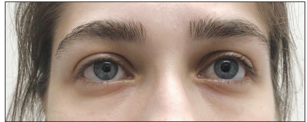
FIGURE 2: Is the (L>R) anisocoria.

further testing, she was diagnosed with BEUM and routine follow-ups were advised to be sufficient enough.