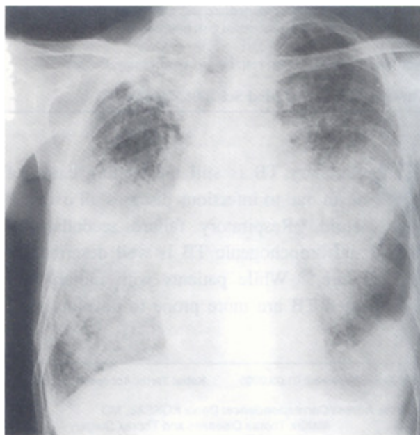
Figure 1. Posterior-anterior chest radiography of the patient showing bilateral reticulo-nodular infiltrates predominantly at the middle zones.

High flow oxygen therapy via nasal canule, empirical antibiotic, corticosteroid (60 mg methylprednisolone) and diuretic therapy was instituted. The patient was quite well with this therapy and did not require mechanical ventilation. On the fourth day of hospitalization sputum smear was positive for acid-fast bacilli and antituberculous therapy was immediately administered with isoniazid (300 mg), rifampicin (600 mg), morphozinamide (2500 mg) and ethambutol (1250 mg). Marked clinical improvement was observed after one week. On the 10 th day, liver function tests were further elevated (AST: 146 U/L, ALT: 163 U/L, GGT: 359 U/L,