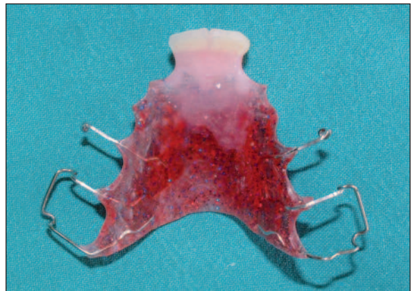
FIGURE 5: The removable partial denture.

A number of cases regarding the severe localized bone loss induced by improper use of orthodontic elastic bands have been reported previously. 1-7 The apical movement of elastic bands leads to the progressive destruction of periodontal ligament and alveolar bone. Several reports emphasize that the direct application of elastic bands over the teeth without being stabilized by a proper orthodontic attachment is a completely undesirable technique for closing a midline diastema. 2,5-7 Most reported cases of periodontal tissue destruction re-