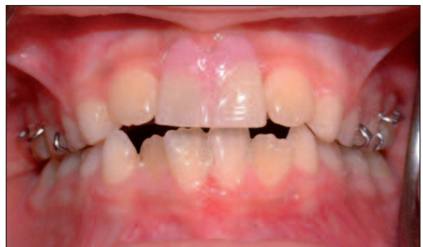
FIGURE 6: Intra-oral view of the patient after prosthetic reconstruction.