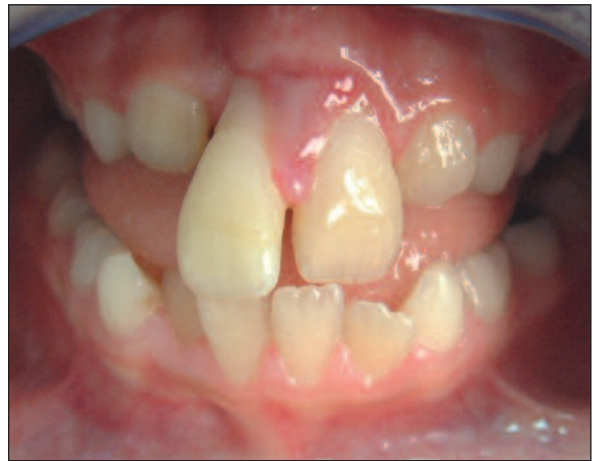
FIGURE 1: Initial intra-oral view of the patient.

Patient was referred for a complete medical evaluation to rule out any underlying systemic dis-