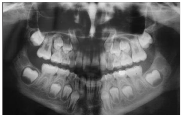
FIGURE 2: Panoramic radiography shows severe bone loss around maxillary incisors.

ease. The results of the medical evaluation, including the laboratory values, were within normal limits for the patient's age. After medical consultation of the patient the affected teeth were extracted. While extraction sites were curetted to remove any granulation tissue, an orthodontic rubber band was found in the extraction socket. Rubber band was removed and the extraction socket was irrigated with sterile saline solution (Figure 3). Following the healing period, prosthetic reconstruction was accomplished (Figure 4-6). A removable space maintainer was chosen for initial treatment as an esthetic and functional temporary management until the definitive treatment could be implemented. Insertion and removal of the retainer were taught to the child and home-care instructions