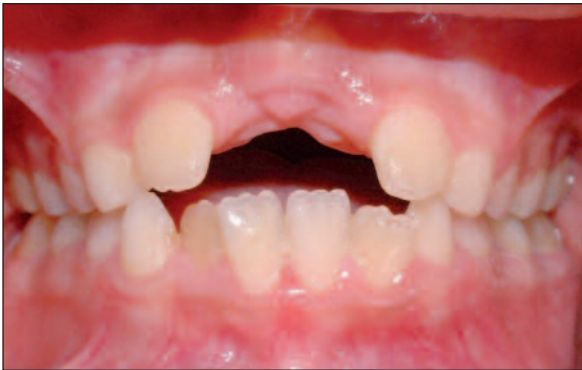
FIGURE 4: Post-treatment clinical view of the patient.

were given. Follow up evaluation was carried out in 6-months recall. Healing was uneventful.