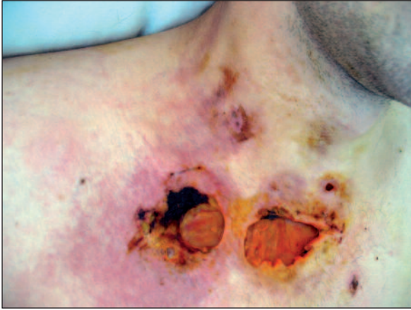
FIGURE 4: Skin necrosis can be seen on anterior chest wall and neck after surgical drainage.

(See for colored form http://akcigerarsivi.turkiyeklinikleri.com/ )