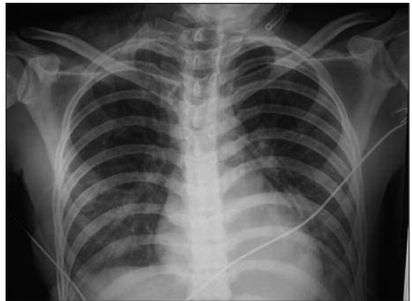
FIGURE 3: Three hemovac drains placed into the mediastinum and both sides of the neck can be seen on the postoperative chest X-ray.

terminated in fourth postoperative day. The general condition of the case got better. Control neck and chest CT findings were normal. All fluid collections and free air between fascias described in previous examination were gone and fat tissue of right side of the neck was thinner. Case was discharged on 19 th day after elective surgery for mandibular fracture.