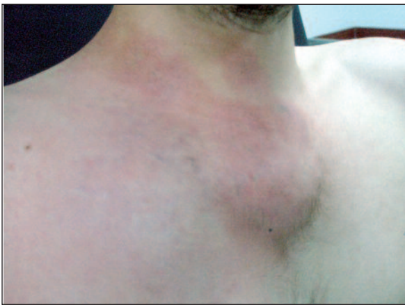
FIGURE 1: Abscess formation can be seen on anterior chest wall. (See for colored form http://akcigerarsivi.turkiyeklinikleri.com/ )