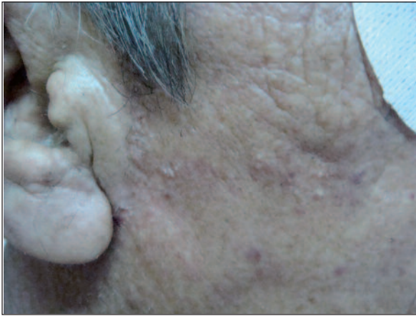
FIGURE 3: Multiple comedones spreading among the papules and around the plaques.

(See for colored from http://tipbilimleri.turkiyeklinikleri.com/ )