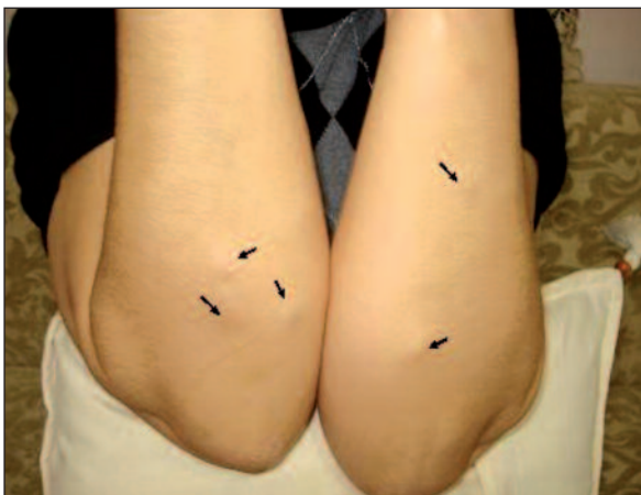
FIGURE 1: Multiple subcutaneous lipomas in both arms.

A 32-year-old female, whose physical examination showed multiple subcutaneous lipomas on her upper trunk, arms and upper legs (Figure 1). It has been learned from the previous history of the patient that she had a treatment because of hyperbilirubinemia when she was a newborn. Athetoid type cerebral palsy was observed in her neurological examination. She was also seen at our clinic with the complaints of painful weakness and burning feet four months ago. Neurological examination revealed sensorimotor polyneuropathy. Nerve conduction studies showed reduction of the sensory conduction velocities. Mini-Mental Status Exam (MMSE) score was 24/30. Disoriented to date and day of the week, good registration but impaired ability to complete serial 7s, impaired attention, and very poor short-term memory were the findings in MMSE. Unable to recall any three items