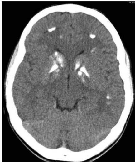
FIGURE 3: Brain tomography, bilateral basal ganglia hyperdensity.

bular acidosis; alterations in liver enzyme levels; abnormal function of glands (thyroid, adrenal, pituitary; and abnormal testicular function) are common. 3 Kernicterus is a potentially fatal neurologic disorder induced by the neurotoxic effects of unconjugated bilirubin on the central nervous system. Cerebral palsy (CP) is a non-progressive disorder of motor function. It describes a diverse group of disorders of movement, posture and tone due to a central nervous system insult. Intraventricular