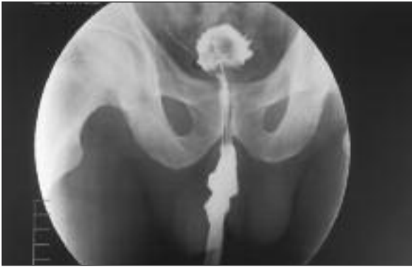
FIGURE 5: Pericatheter retrograde urethrogram.

He voided with a maximal urinary flow of 14 ml/s without residual urine at third month of follow up. X-ray diffraction analysis of the stone revealed the stone to be magnesium ammonium phosphate.