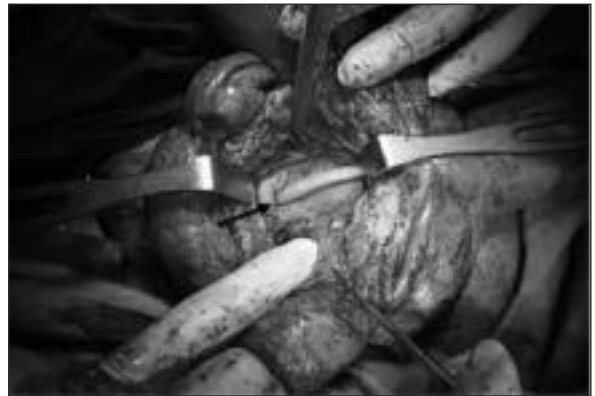
FIGURE 3: Surgical area after stone extraction and debridement (dark arrow is urethra).