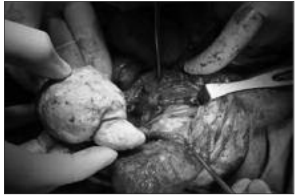
FIGURE 2: External urethrotomy and stone extraction.