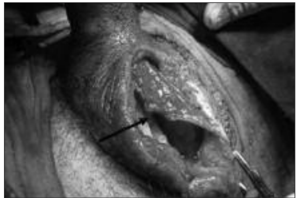
FIGURE 4: Penile pedicle island flap.

Suprapubic catheter was removed and a urethral 18-F Foley catheter placed for 14 days. After pericatheteral retrograde urethrogram examination had been performed (Figure 5), the indwelling catheter was removed and spontaneous voiding was observed.